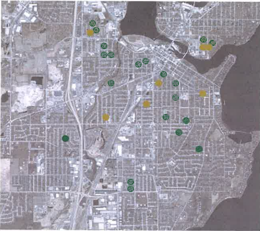
2025 Project Map