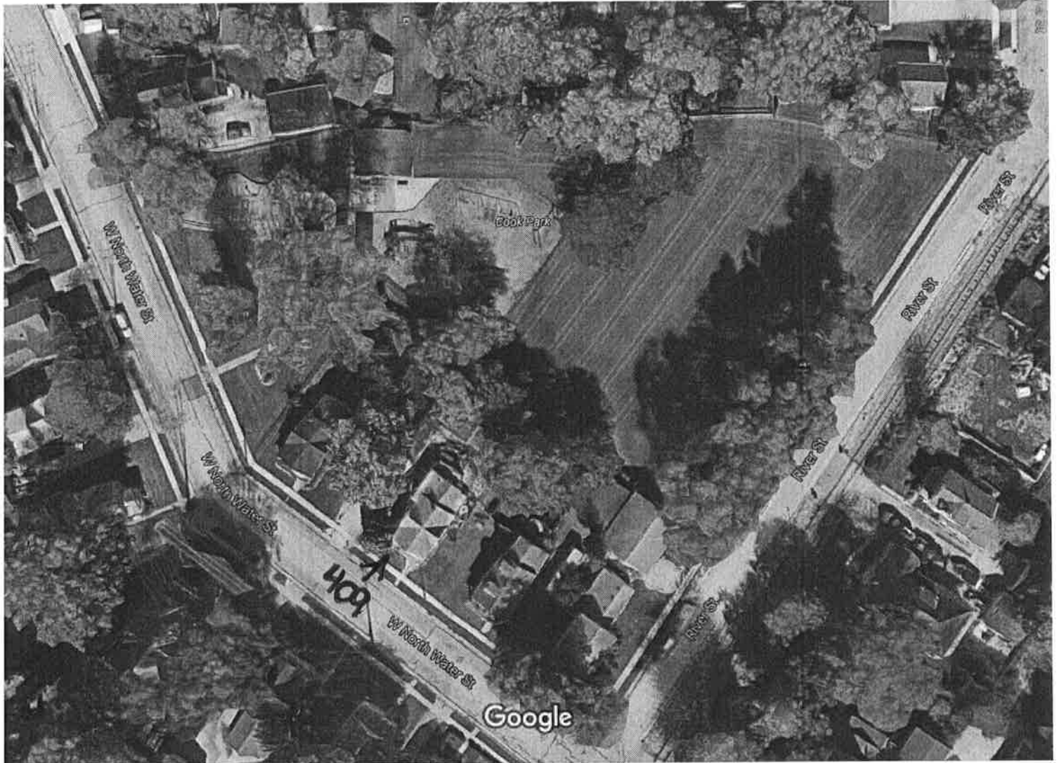
50 ft