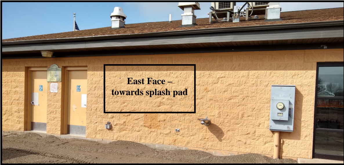
East Face – towards splash pad