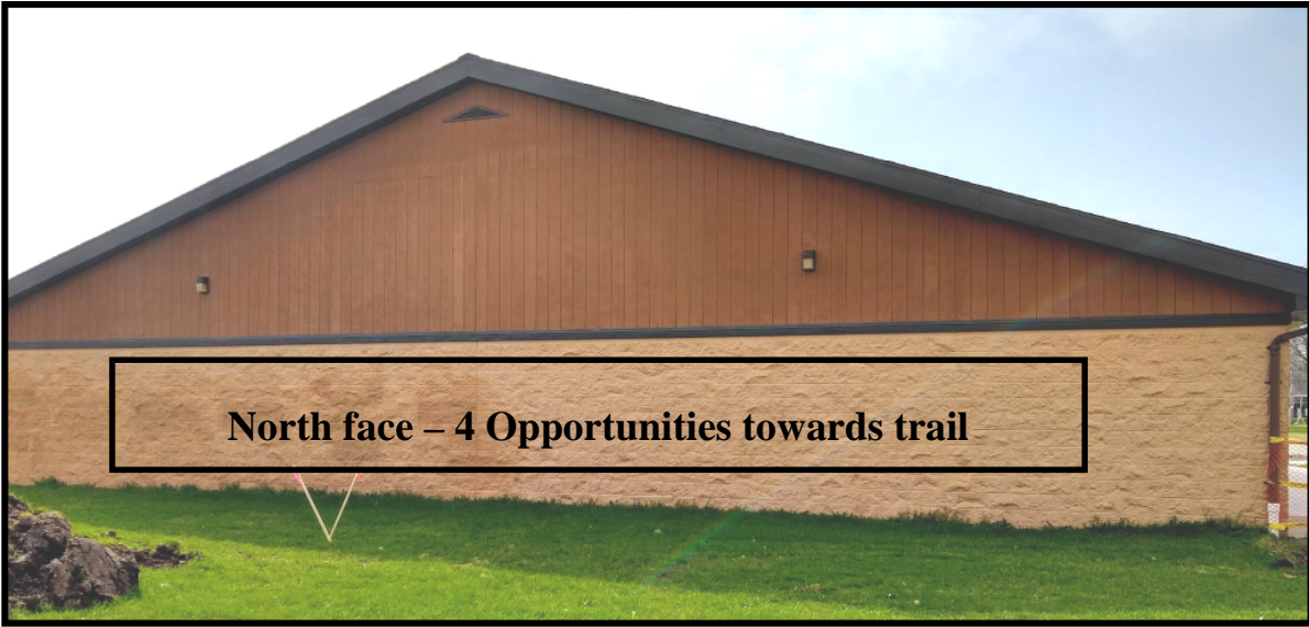
North face – 4 Opportunities towards trail