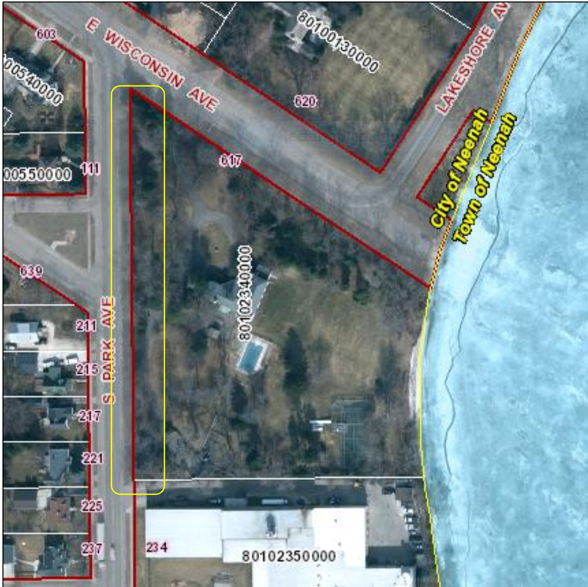
Site Location – 617 E. Wisconsin Avenue